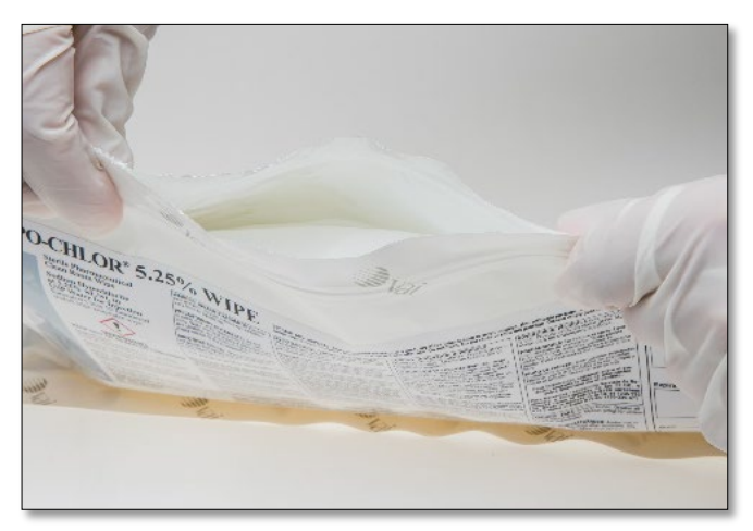
Zip-Lock Style Bag