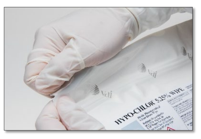
Easy Tear Packaging