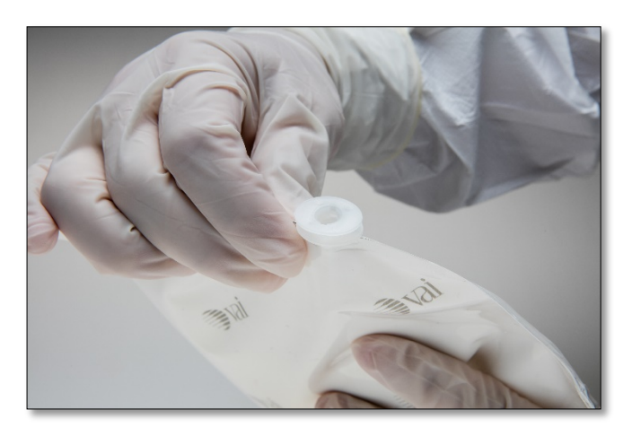
Ported bag for aseptic filling into sterile components